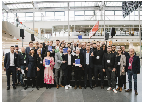
Winners and jury 2023