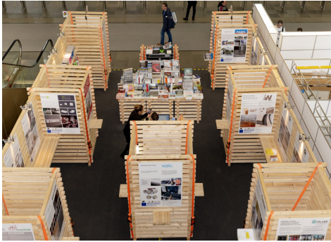
Booth Innovation Award Architecture+ Building