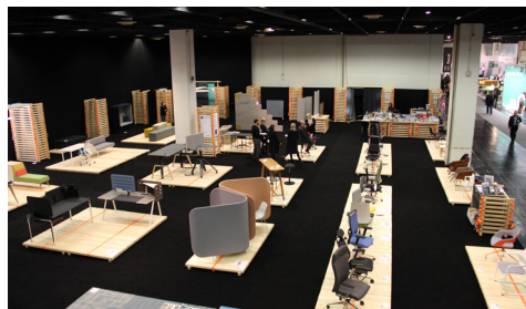
Stand system Innovation Award Architecture+ Technology 2016

The Innovation Awards are addressed to companies and processing businesses as well as architects and interior designers working in these areas. Based on architectural criteria, they award products and conceptual solutions which equally impress by their design and technical aspects.