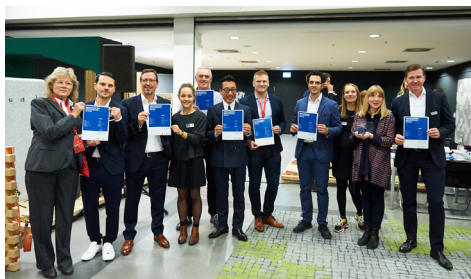
Winners of the Innovation Award Architecture+ Office 2018

Cup and certificate of the Innovation Award are proof of the highest architectural quality of the awarded product. The logo of the Innovation Award may be used for free on all advertising media of the awarded company for one year and shows all architects and interior designers that the product has been assessed by renowned colleagues and found excellent. The prizes are awarded in different categories.