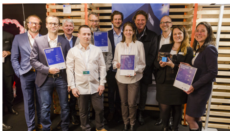
Winners of the Innovation Award Architecture+ Technology 2018