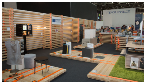
Stand system Innovation Award Architecture+ Office 2018

The Innovation Awards are addressed to companies and processing businesses as well as architects and interior designers working in these areas. Based on architectural criteria, they award products and conceptual solutions which equally impress by their design and technical aspects.