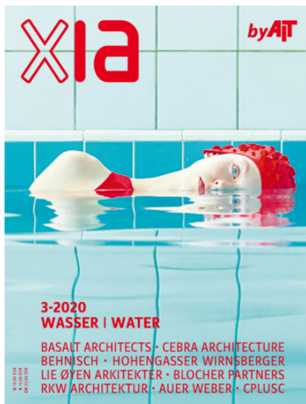
XIA by AIT 3-2020

Additionally, every award winner receives the logo of the Innovation Award as a digital file and may use it for his own advertising activities for one year.