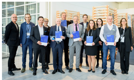
Winners of the Innovation Award Architecture+ Technology 2019